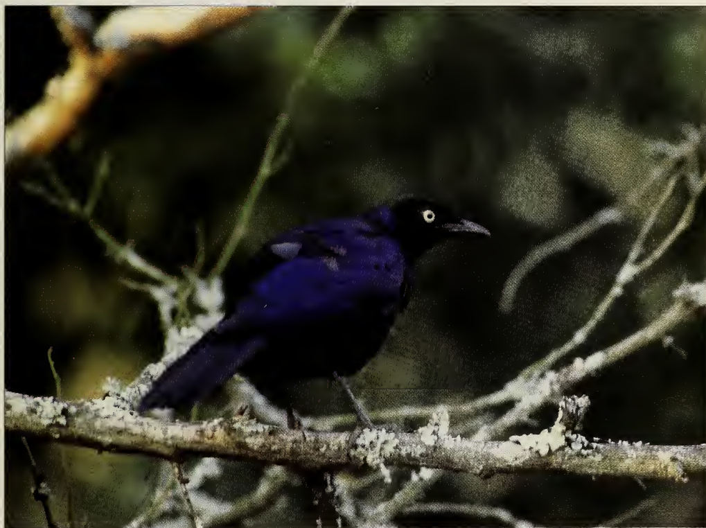
Figure 1. Rüppell's Long-tailed Glossy Starling Lamprotornis purpuropterus , Uganda (Johan Verbauck)

L'article traite de l'identification des choucadors (ou merles métalliques) africains au plumage uniformément bleu-vert, placés traditionnellement dans le genre Lamprotornis . Si les espèces forestières de l'Afrique centrale et occidentale ne posent que peu de problèmes d'identification, ceci n'est pas le cas pour les espèces de l'Afrique orientale et méridionale, qui comprennent un certain nombre de formes assez semblables dont les aires de distribution se chevauchent. Bien que les vocalisations et le plumage juvénile soient souvent caractéristiques, l'observation détaillée des patterns de plumage dans des conditions d'éclairage convenables permettent également, dans la plupart des cas, d'identifier correctement l'espèce. Si, à quelques exceptions près, les points d'identification sont relativement bien connus, beaucoup reste à découvrir sur l'écologie et la biologie de ce groupe.